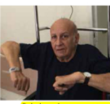
Rehab scalp acupuncture at Bnei-Zion Hospital.

I sat in a conference room with the integrative medical team and witnessed the strong level of co-operation, their sincerity and desire to provide the highest level of care. This devotion drives the operation and makes it the success that it has become. Seasoned practitioners must be able to accept the need to learn from one another, at times having to put their own ideas and prejudices aside, and accept methods that have proven successful. At this fast-paced forum, decisions are taken quickly and are primarily based on successes. There is no place for ego, and no time for heroes; the team functions as one. All attempts are made to achieve the best possible result for the sake of the patients and for the program as a whole.