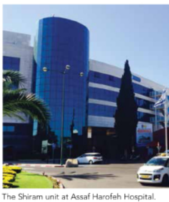
The Shiram unit at Assaf Harofeh Hospital.

Record keeping is imperative for accurate follow-up, accountability, safety, and for successful development of the program. Tongue images, pulse dynamics, and full