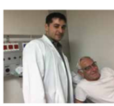
In the oncology ward, Ichilov, Tel Aviv.

The natural health integrative team chose the additional task of caring for staff as well as patients. By giving staff relief from physical and emotional tension, the morale levels improve, staff are more able to cope